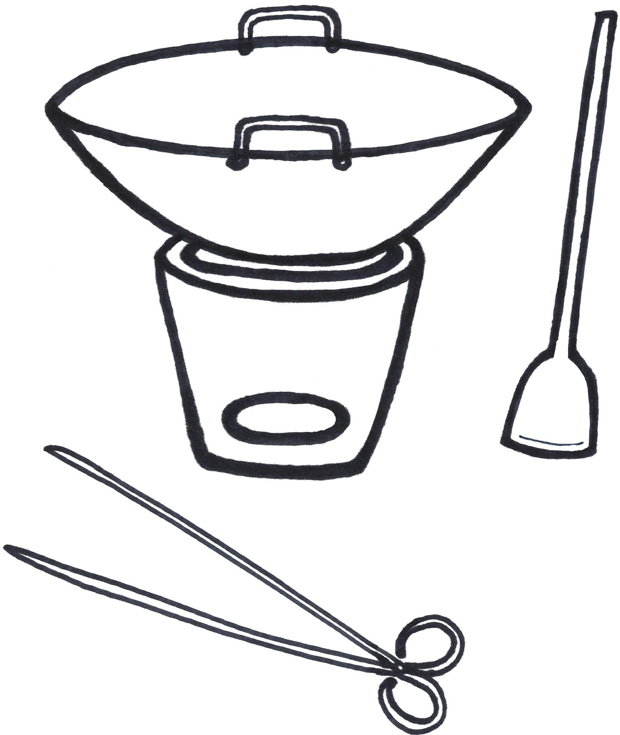
Wok, tang en wok spatel - 鑊, 火鉗及鑊鏟